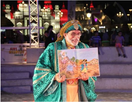
HAKAWATI STORY TELLING