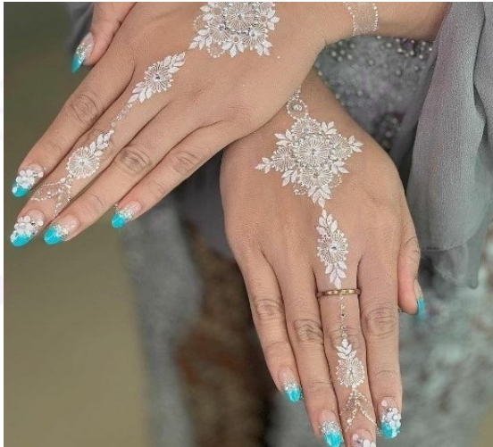
WHITE HENNA ARTIST