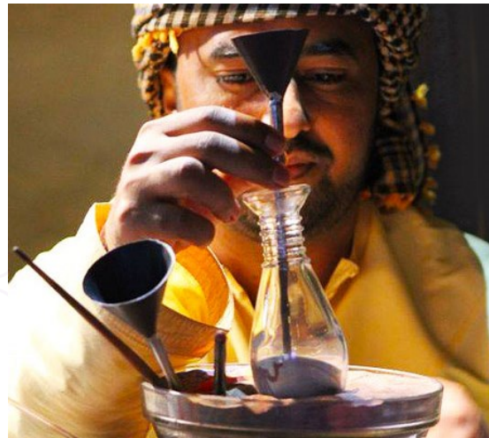
BOTTLE SAND ART