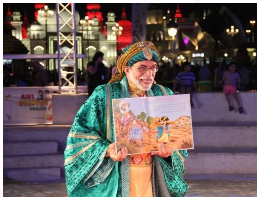
HAKAWATI STORY TELLING